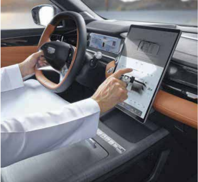
Functionality at your fingertips Convenient and intuitive user interface