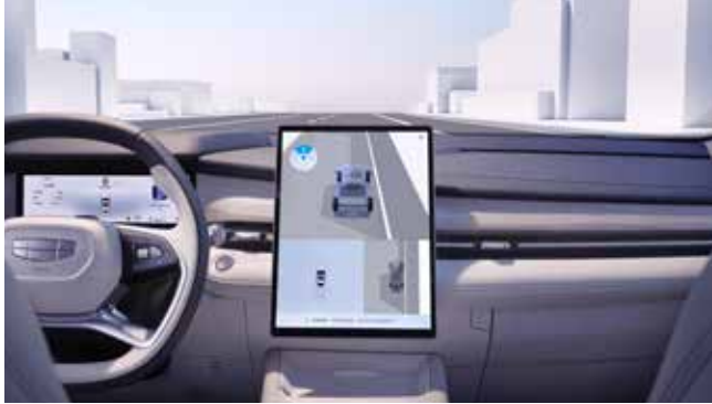
540° transparent chassis