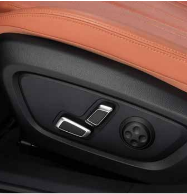
Unparalleled adjustment and support 6-way power driver seat with 4 way lumbar support