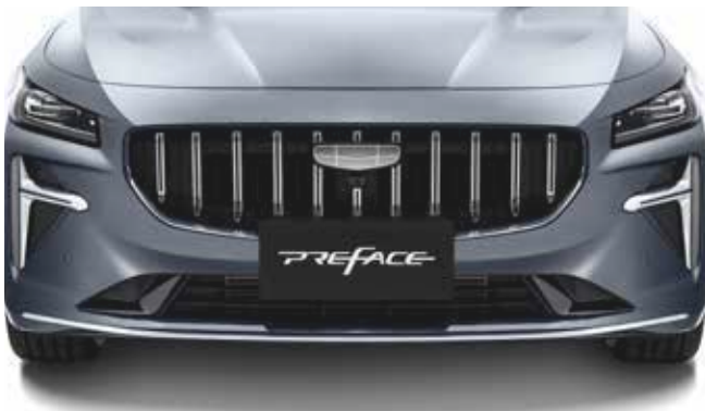
A visage of bold sophistication A majestic bold grille with exquisite details

From its heart-pounding performance to its breathtaking aesthetics, Preface is designed not just to meet but to exceed the desires of the discerning driver.