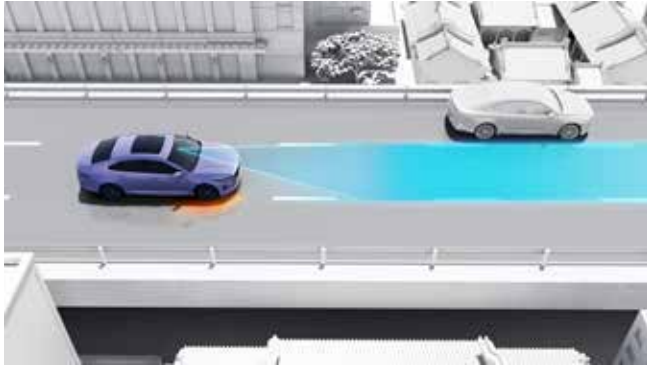
Lane keeping assist