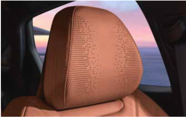
Experience the symphony of the road Harman™ infinity deluxe headrest audio system