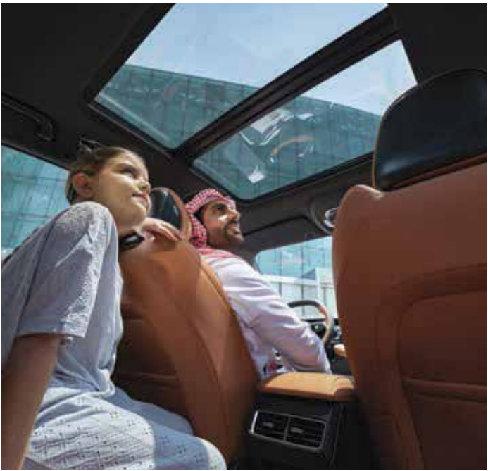
Bask in the expanse of the sky Class-leading 0.5m² panoramic sunroof