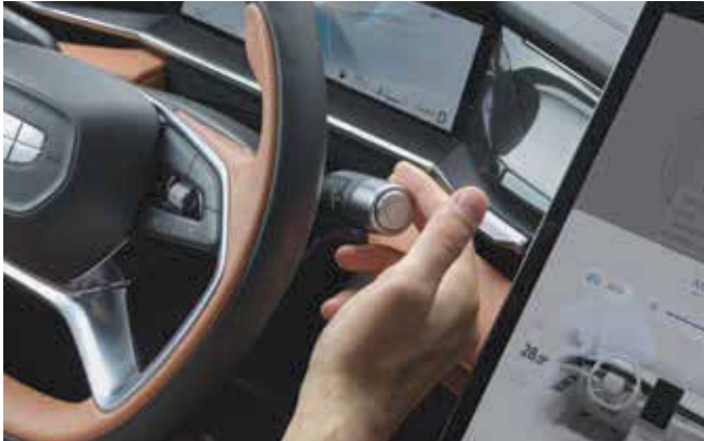
Effortless ignition and modern practicality Column shifter