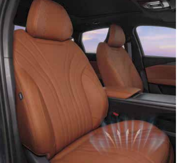
Comfort in every climate Front row ventilation