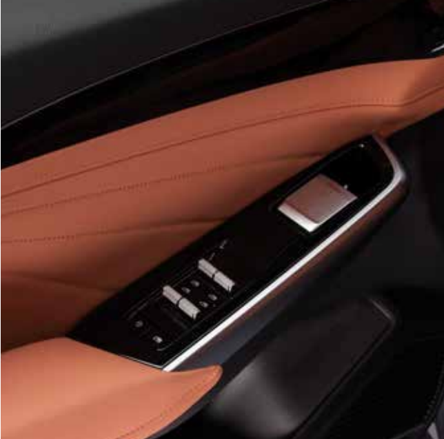
Convenience within reach Power windows