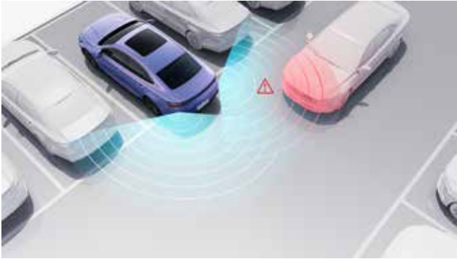
Largest number-in-class front 2/rear 4 parking radars