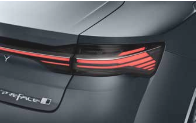
Merging safety with elegance Class-leading full LED run-through taillight