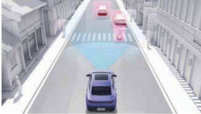
Automatic emergency braking