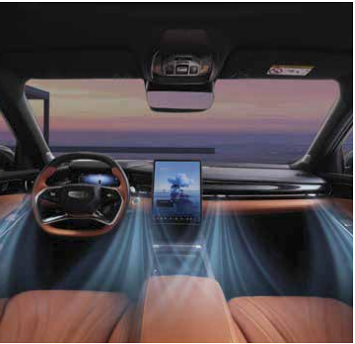
Breathe in purity CN95 cabin air filter