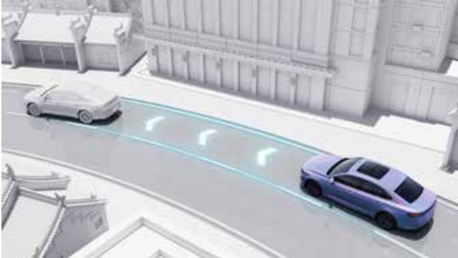
Full speed adaptive cruise