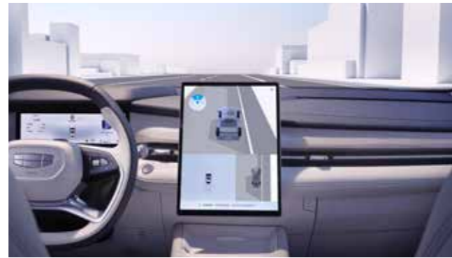
540° transparent chassis