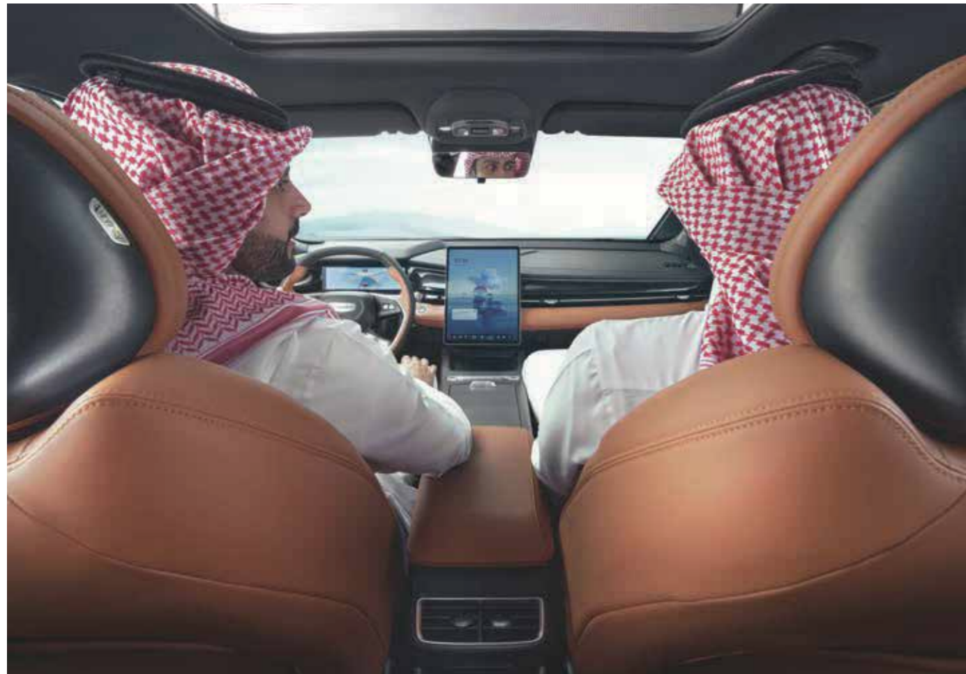
Immerse yourself in an oasis of luxury Biggest-in-class 4825mm car body

Every touchpoint within its cabin has been perfected to a tee, blending comfort with functionality in a space designed to transcend expectations.