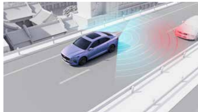
Lane departure warning