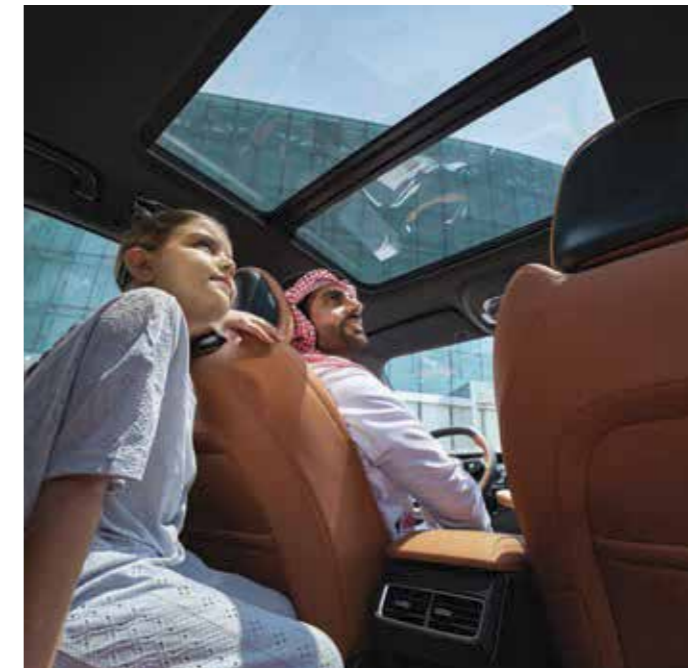
Bask in the expanse of the sky Class-leading 0.5m 2 panoramic sunroof