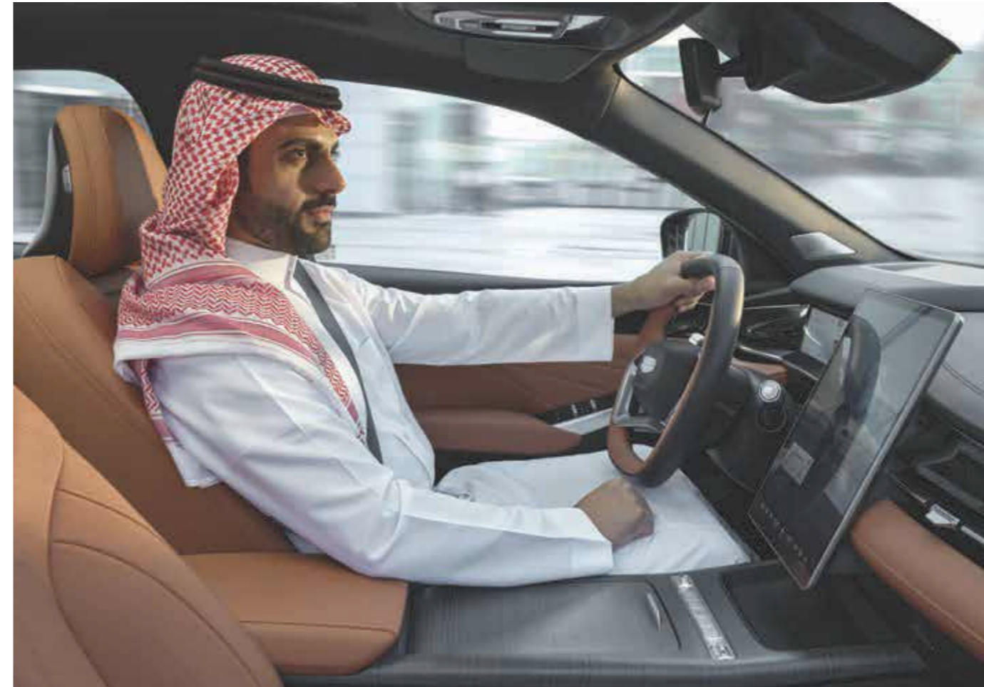
Masterpiece of aerodynamic engineering Biggest-in-class 1618mm front and rear tread