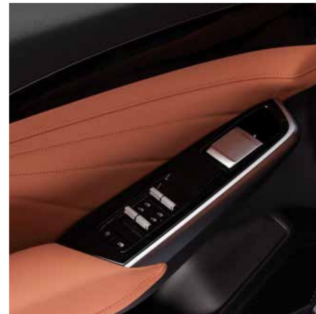
Convenience within reach Power windows