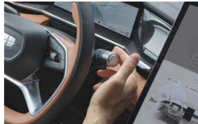
Effortless ignition and modern practicality Column shifter