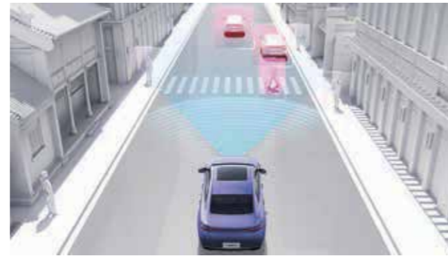
Automatic emergency braking