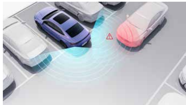
Largest number-in-class front 2/rear 4 parking radars