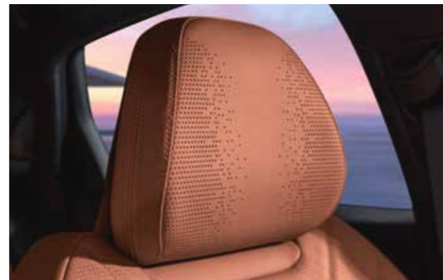
Experience the symphony of the road Harman™ infinity deluxe headrest audio system