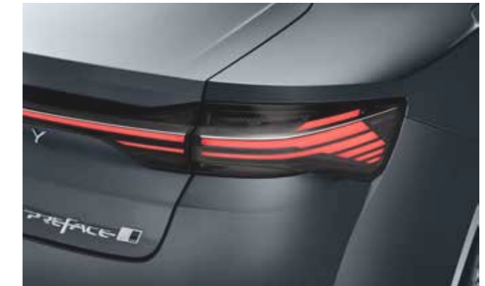
Merging safety with elegance Class-leading full LED run-through taillight