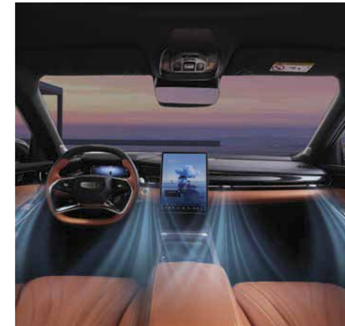
Breathe in purity CN95 cabin air filter