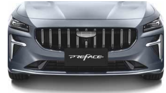
A visage of bold sophistication A majestic bold grille with exquisite details

From its heart-pounding performance to its breathtaking aesthetics, Preface is designed not just to meet but to exceed the desires of the discerning driver.