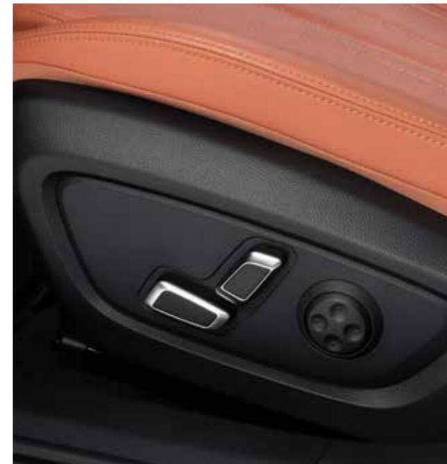
Unparalleled adjustment and support 6-way power driver seat with 4 way lumbar support