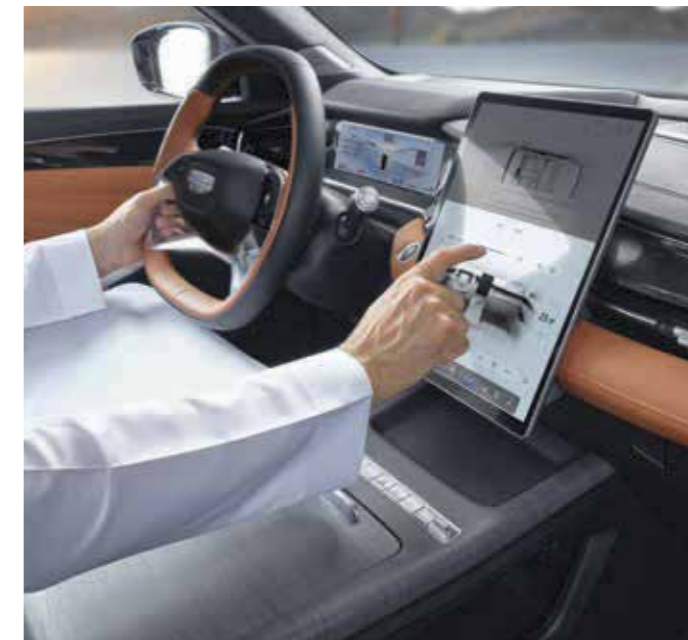
Functionality at your fingertips Convenient and intuitive user interface