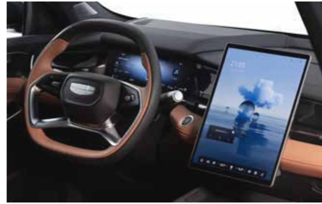
Engage with clarity 13.2" largest-in-class 2K high-res infotainment display