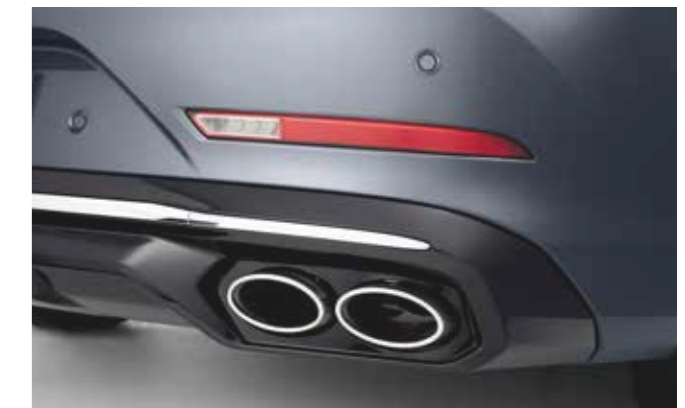
Enhanced performance with distinctive aesthetic Quad exhaust pipes