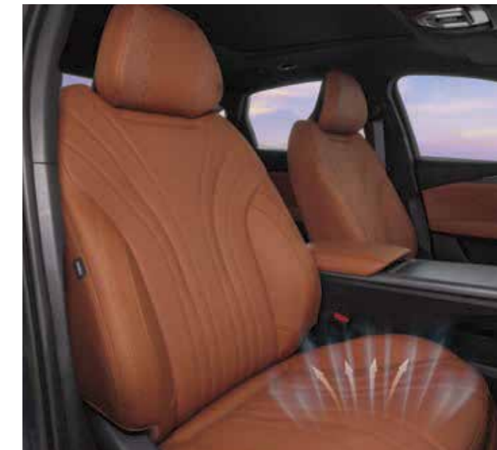
Comfort in every climate Front row ventilation